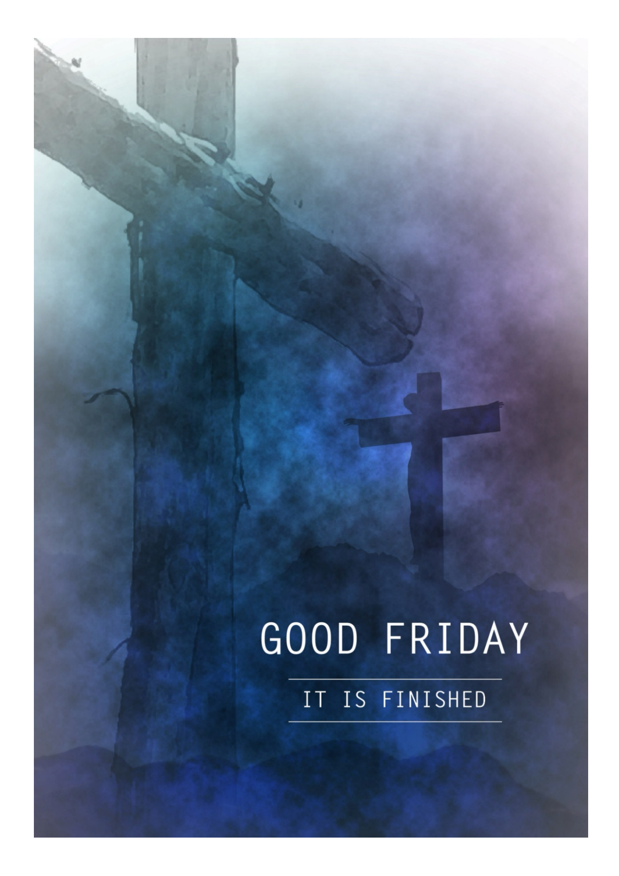
Bethany Lutheran Church (ELCA) Service of Shadows