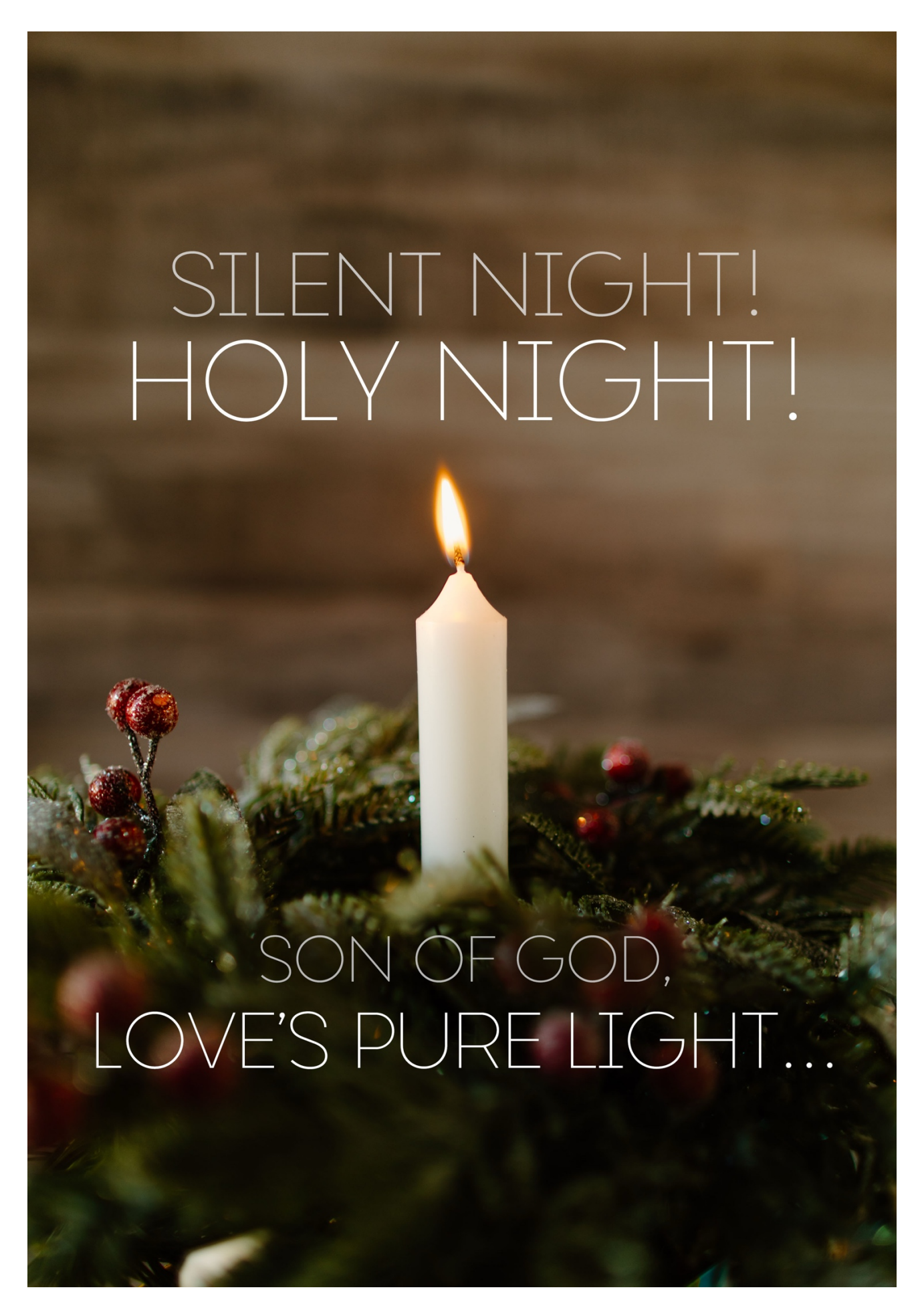
Christmas Eve Candlelight Worship Bethany Lutheran Church (ELCA)