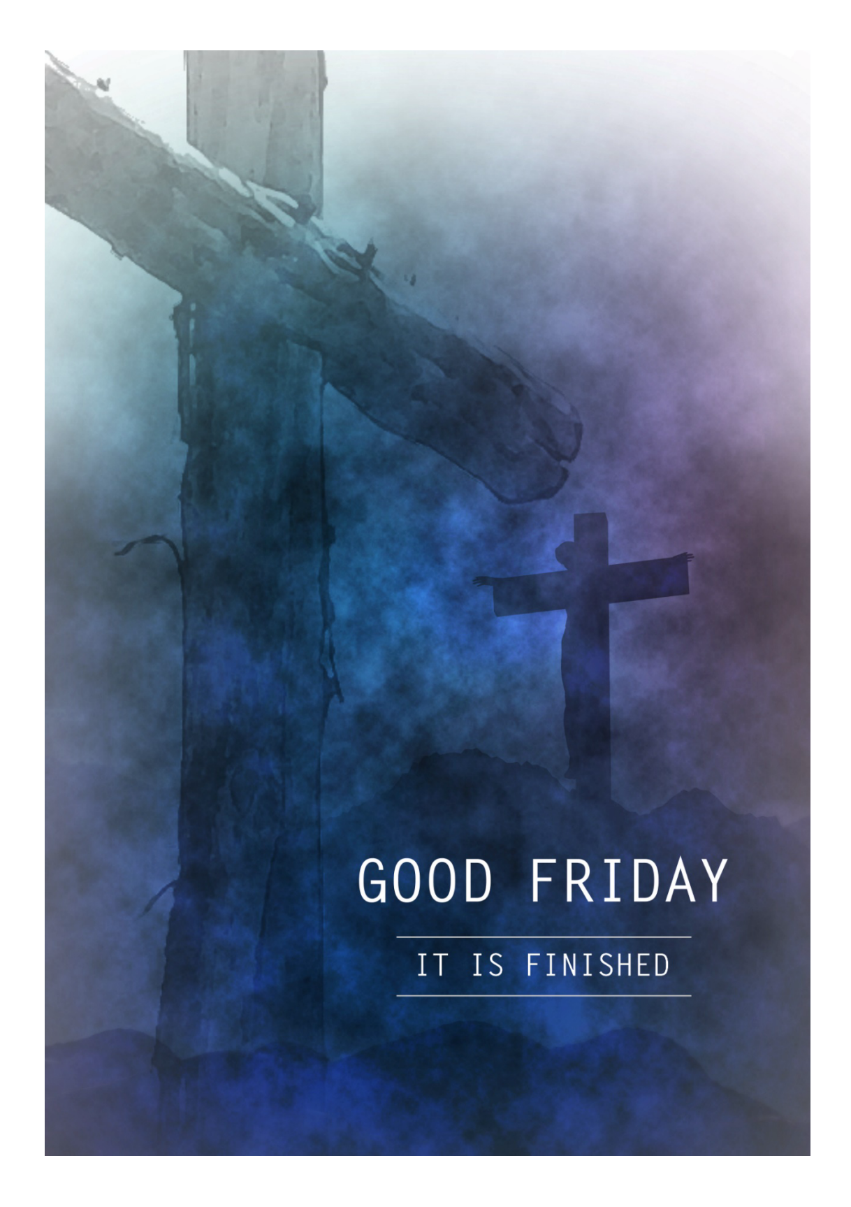
Bethany Lutheran Church (ELCA) Service of Shadows March 29, 2024