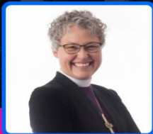
BISHOP AMY CURRENT SEIA SYNOD - ELCA

NOW TO GOD WHO BY THE POWER AT WORK WITHIN US IS ABLE TO ACCOMPLISH ABUNDANTLY FAR MORE THAN ALL WE CAN ASK OR IMAGINE... EPHESIANS 3:21