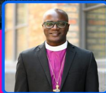
BISHOP YEHIEL CURRY METRO CHICAGO SYNOD - ELCA