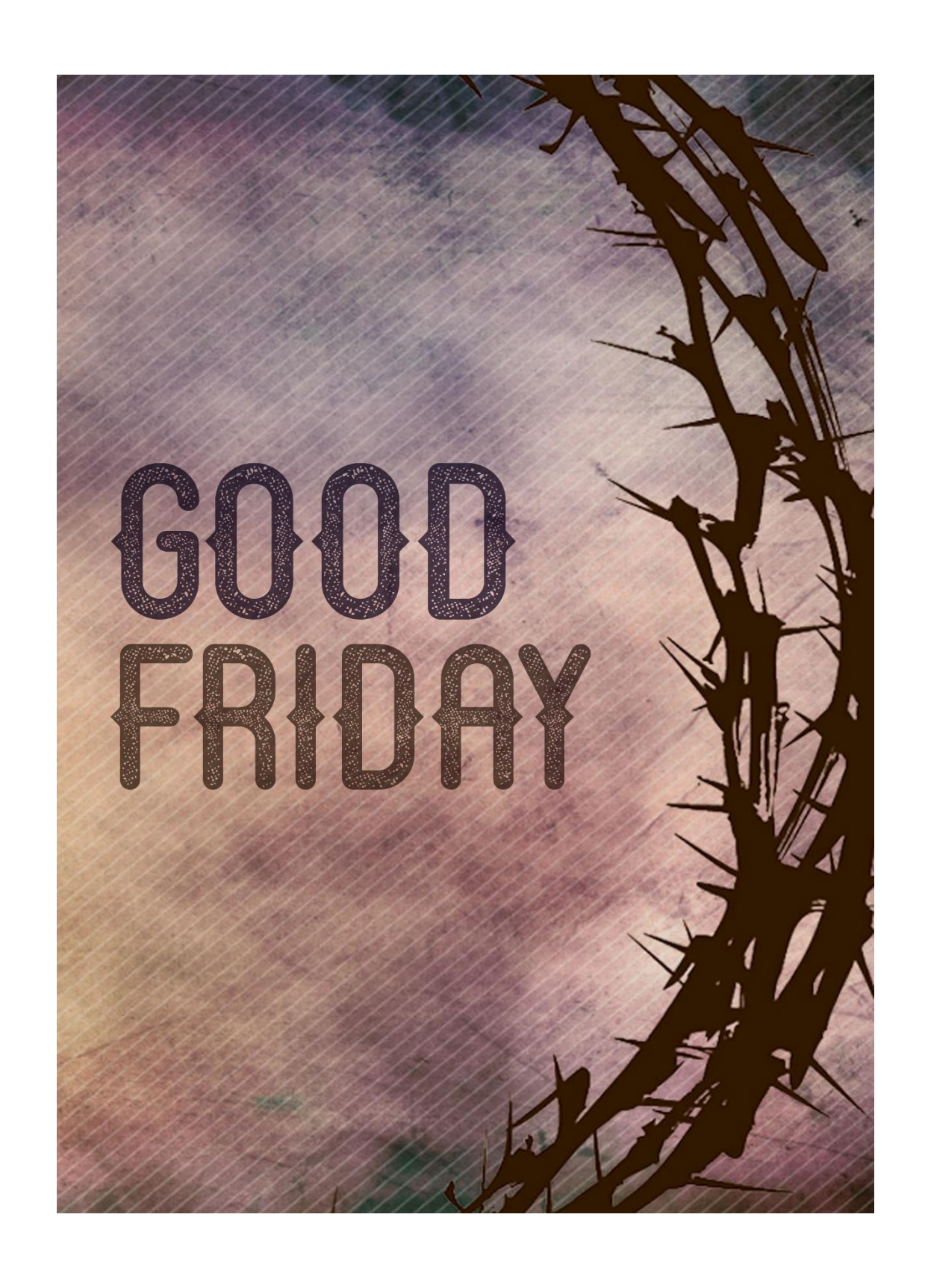
Bethany Lutheran Church (ELCA) Service of Shadows/Good Friday April 7, 2023