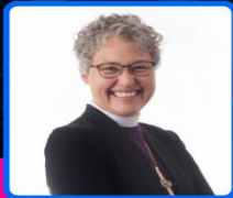
BISHOP AMY CURRENT SEIA SYNOD - ELCA

NOW TO GOD WHO BY THE POWER AT WORK WITHIN US IS ABLE TO ACCOMPLISH ABUNDANTLY FAR MORE THAN ALL WE CAN ASK OR IMAGINE... EPHESIANS 3:21