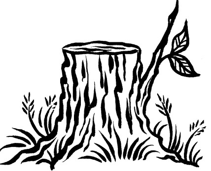
Draw more leaves and branches on the small shoot coming out of the trunk.

Did you know about Jesus' family tree? Jesus is called a shoot, or new plant, growing from the stump of Jesse. Jesus comes from the family of King David, the son of Jesse.