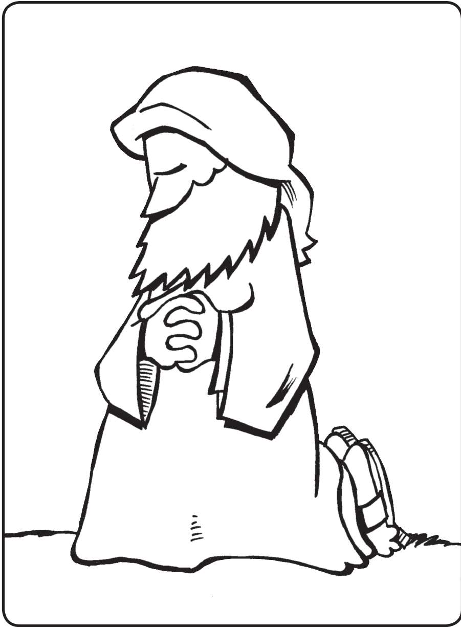
Jesus taught his disciples about prayer.

In today's Bible story, Jesus teaches us how to pray by giving us the Lord's Prayer.