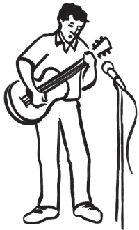
Someone playing a musical instrument