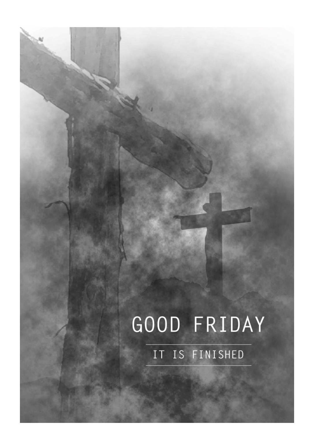
Bethany Lutheran Church (ELCA) Service of Shadows April 2, 2021