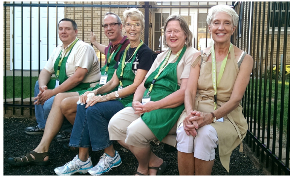
Members of St. Paul volunteer to scrape plates or sort recyclables to help the congregation be more environmentally friendly.

Lenten supper and special events dishes | Earth Weekend promotion | Alternative transportation weekends | Make It Yours neighborhood clean-up | Increased and improved recycling | Coffee cup initiative.