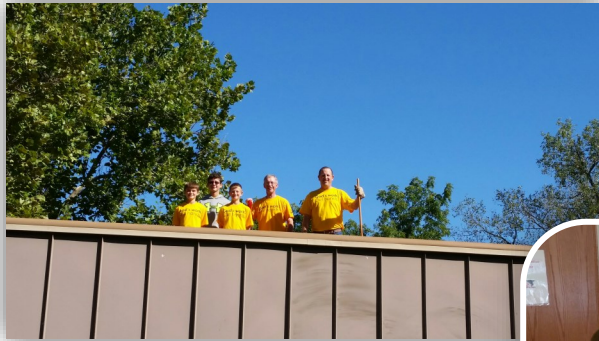
Left: Clearing the roof at Families Inc. of debris and standing water. We also cleaned windows and pulled weeds.