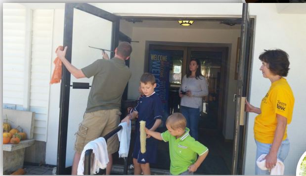
Left: Washing windows inside and out around the church structure.