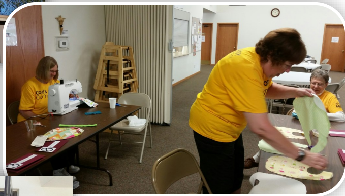
Right: Piecing together much needed bibs for a non-profit daycare in Iowa