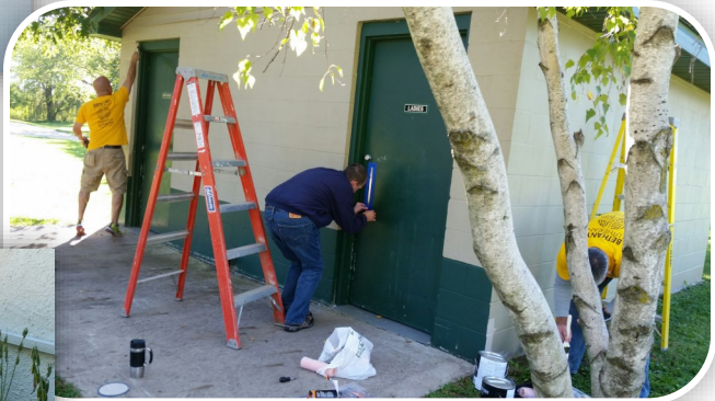
Right: Painting the exterior of the bathrooms at Beranek Park.