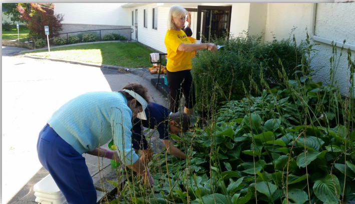
Left: Trimming, pruning and pulling weeds around the church property.